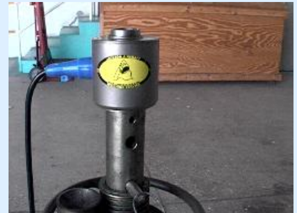
Top of jack mounting