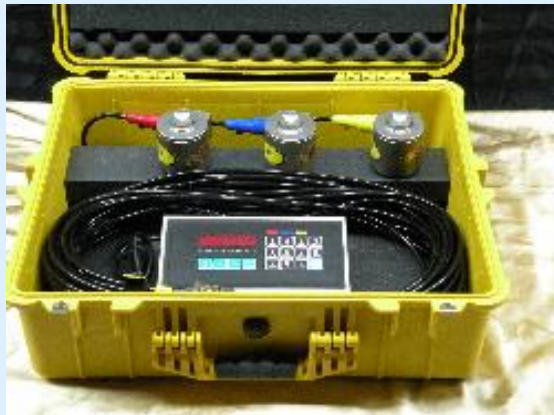
M2000-3-10CS Case Set Kit

Three 10,000lb cell transducers, one inch mounting, 30,000lbs total system capacity, digital indication.