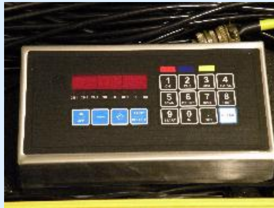
M2000 three channel digital indication